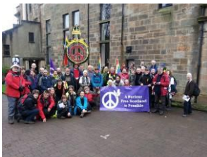
The Walk for Peace walkers preparing for its walk and major public rally to George Square, Glasgow