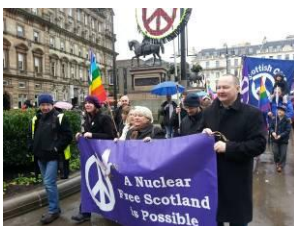
Glasgow councillors and MSP's at the city centre 'Walk for Peace' rally