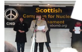
Lord Provost of Glasgow speaking at CND Scotland 'Walk for Peace' rally

NFLA: http://www.nuclearpolicy.info CNFE: http://www.cnfe.eu Mayors for Peace: http://www.mayorsforpeace.org 2020 Vision: http://www.2020visioncampaign.org KIMO: http://www.kimointernational.org ICAN-UK: http://www.ican-uk.org