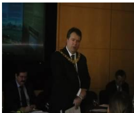
Lord Provost of Edinburgh welcomes delegates to joint NFLA, Mayors for Peace, Abolition 2000 & PNND seminar

The briefing outlines the key concerns of this incident and how the NFLA is following up the matter with the UK and Irish Governments. The report is on the NFLA website.