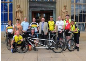
Bike for Peace group with Stirling councillors during Scottish tour