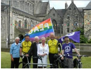
Lord Provost of Renfrew with Bike for Peace group at Paisley Abbey