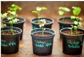
Manchester's ginkgo tree seeds from Hiroshima second generation A-bombed tree