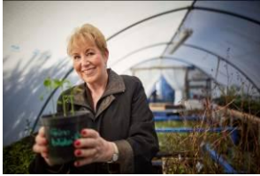
Lord Mayor of Manchester formally receives seeds from Hiroshima