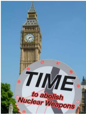
National demonstration in Westminster to abolish nuclear weapons