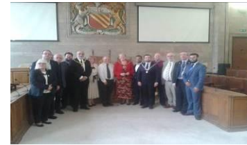
Launch of the UK and Ireland Mayors for Peace Chapter, including many NFLA members

NFLA: http://www.nuclearpolicy.info Mayors for Peace: http://www.mayorsforpeace.org 2020 Vision: http://www.2020visioncampaign.org KIMO: http://www.kimointernational.org ICAN-UK: http://www.ican-uk.org