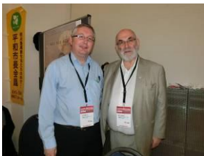
NFLA Secretary and NFLA Chair at Mayors for Peace stall within the ICAN Civil Society Forum