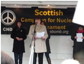
Lord Provost of Glasgow speaks at CND Scotland rally