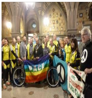
Bike for Peace delegation meet Lord Mayor of Manchester for civic reception and launch of World Tour.

English membership has remained stable over 2014. Its first seminar in 2015 will be in March in Manchester Town Hall.