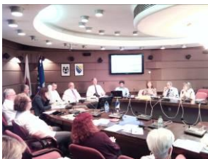
Mayors for Peace board meeting in Sarajevo, Bosnia