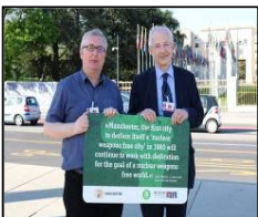
The NFLA Secretary and the Lord Mayor of Manchester with pledge to continue to support nuclear weapon free world