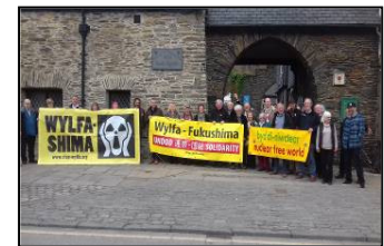
Welsh groups meet together in Machynlleth to discuss cooperating more closely