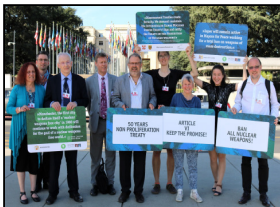
International delegates pledge to campaign on maintaining the key elements of the MPT outside the UN buildings in Geneva