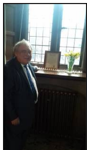
The NFLA English Chair at Sheffield's Mayors for Peace event