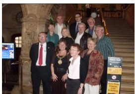
NFLA English Forum /M4P seminar Oxford Town Hall