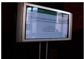
Nuclear emergency planning presentation in Glasgow