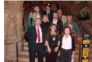
The Mayor of Oxford and some of the speakers and attendees to the NFLA English Forum / UK Mayors for Peace meeting and seminar in Oxford Town Hall

KEY WEBSITE LINKS: http://www.nuclearpolicy.info http://www.mayorsforpeace.org http://www.2020visioncampaign.org http://www.kimointernational.org