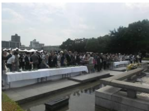
Hiroshima flower ceremony at Peace Memorial Park