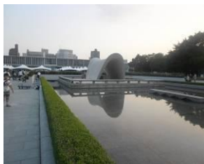
Hiroshima Peace Park, 6 th August 2013 following peace ceremony