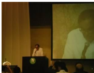
US film director Oliver Stone addresses Conference