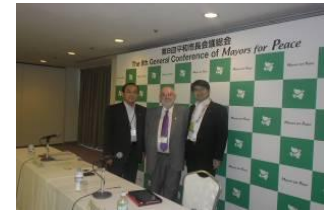
The NFLA Chair with the Mayors of Hiroshima and Nagasaki at the Mayors for Peace Conference

NFLA: http://www.nuclearpolicy.info Mayors for Peace: http://www.mayorsforpeace.org 2020 Vision: http://www.2020visioncampaign.org KIMO: http://www.kimointernational.org ICAN-UK: http://www.ican-uk.org