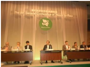
Opening session of the Mayors for Peace Conference in Hiroshima