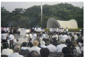
Hiroshima Peace Ceremony 2013