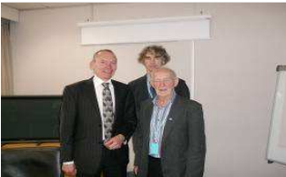
NFLA Wales Vice Chair with Welsh Environment Minister, Cardiff