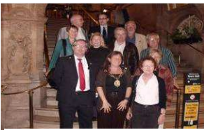
Mayor of Oxford and attendees to July NFLA English Forum meeting