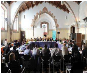
Proceedings of the Mayors for Peace Executive Conference in Granollers

The NFLA has close co-operation with a large number of groups, but works in particular with two influential local government groups – Mayors for Peace and KIMO International.