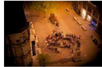
2011 was the 25 th anniversary of the Chernobyl disaster. Worldwide commemorations were held, including this one in Manchester city centre.

NFLA website: http://www.nuclearpolicy.info Mayors for Peace website: http://www.mayorsforpeace.org KIMO website: http://www.kimointernational.org