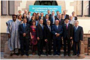
Delegates to the Mayors for Peace Executive Conference